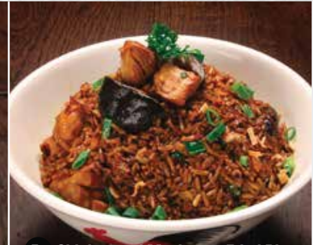
F5 Chicken and Mushroom Fried Rice 冬菇雞肉飯 $21.00