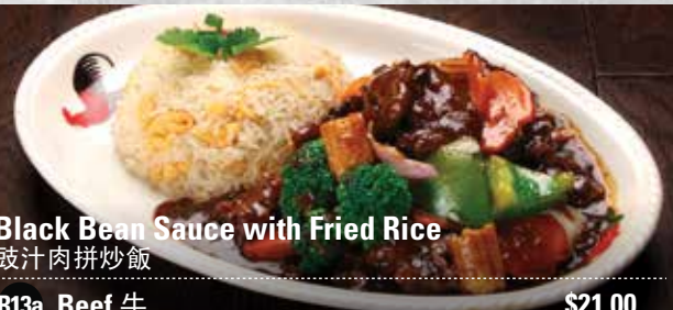
Black Bean Sauce with Fried Rice 豉汁肉拼炒飯