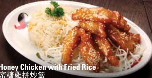
R12 Honey Chicken with Fried Rice 蜜糖雞拼炒飯 $21.00