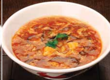
208 Seafood Hot & Sour Soup 海鮮酸辣羹 $13.90