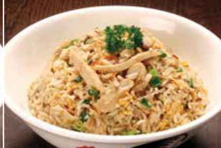
F4 Chicken Fried Rice 雞肉炒飯 $21.00