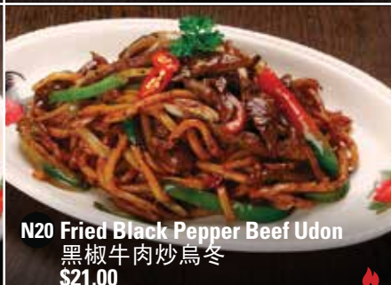
N20 Fried Black Pepper Beef Udon 黑椒牛肉炒烏冬 $21.00