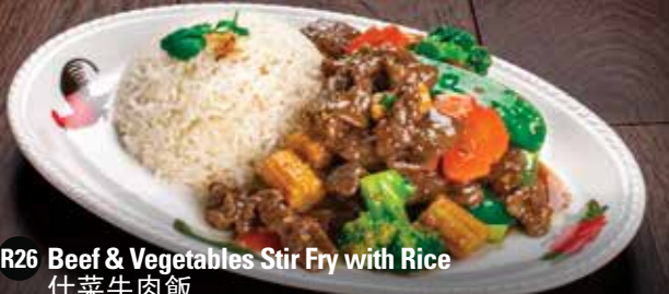
R26 Beef & Vegetables Stir Fry with Rice 什菜牛肉飯