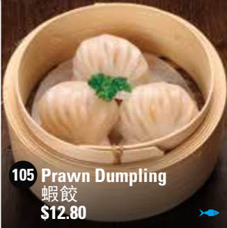
105 Prawn Dumpling 蝦餃 $12.80