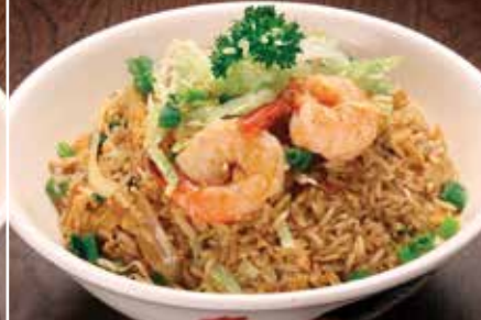
F7 Nasi Goreng 馬來炒飯 $21.00