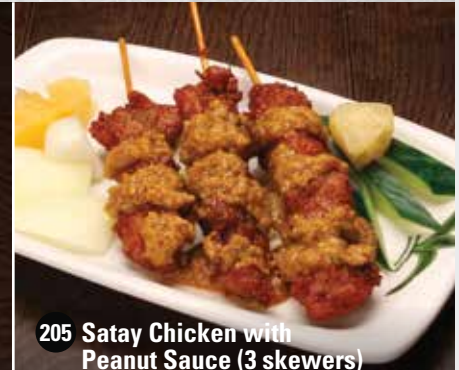
205 Satay Chicken with Peanut Sauce (3 skewers) 沙爹雞串配花生醬 $14.00