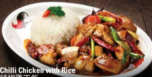
R19 Chilli Chicken with Rice 辣椒雞丁飯 $21.00