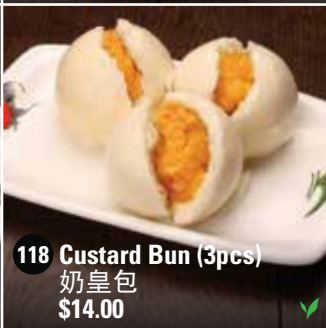
118 Custard Bun (3pcs) 奶皇包 $14.00

Please inform our staff on any food allergies. 如有對任何食物過敏，請示意我們的服務員。 | Images are for illustration purposes only. Vegetables are subject to seasonal availability. 圖片只供參考。蔬菜會由季節轉換而定。