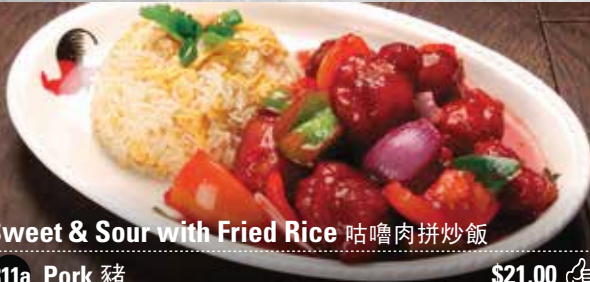
Sweet &amp; Sour with Fried Rice 咕嚕肉拼炒飯

Please inform our staff on any food allergies. 如有對任何食物過敏，請示意我們的服務員。 | Images are for illustration purposes only. Vegetables are subject to seasonal availability. 圖片只供參考，蔬菜會由季節轉換而定。