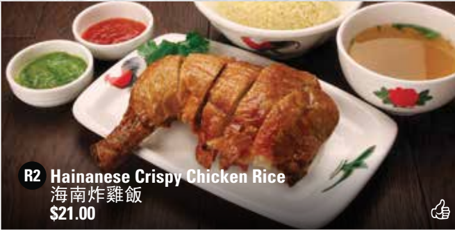
R2 Hainanese Crispy Chicken Rice 海南炸雞飯 $21.00