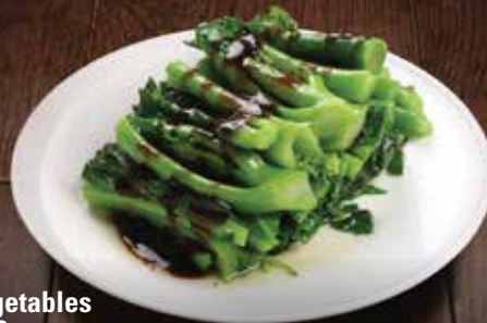
212 Steamed Vegetables with Oyster Sauce 蠔油芥蘭 $15.50