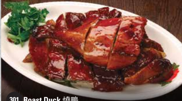
301 Roast Duck 燒鴨