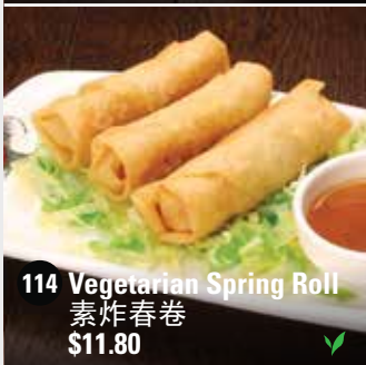
114 Vegetarian Spring Roll 素炸春卷 $11.80