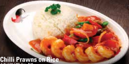
R16 Chilli Prawns on Rice 辣椒蝦仁飯 $23.00