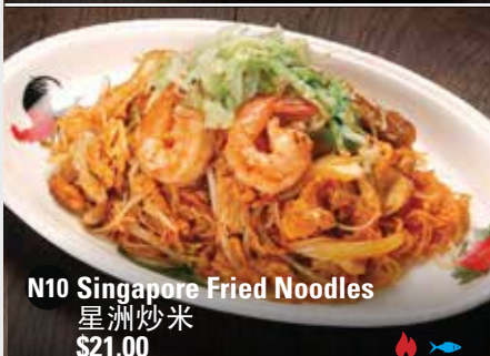
N10 Singapore Fried Noodles 星洲炒米 $21.00