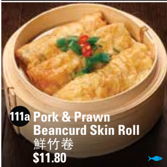
111a Pork & Prawn Beancurd Skin Roll 鮮竹卷 $11.80