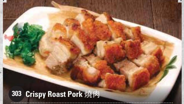
303 Crispy Roast Pork 燒肉