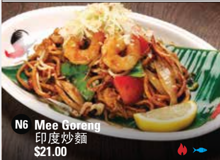
N6 Mee Goreng 印度炒麵 $21.00