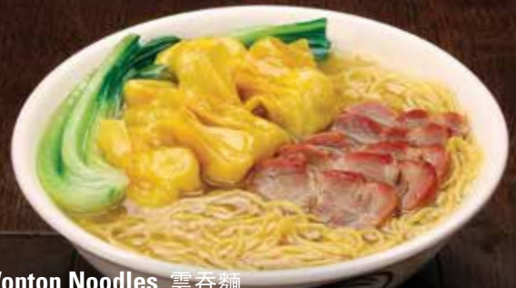
Wonton Noodles 雲吞麵