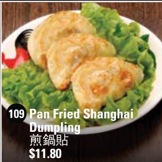
109 Pan Fried Shanghai Dumpling 煎鍋貼 $11.80