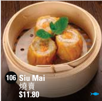
106 Siu Mai 燒賣 $11.80