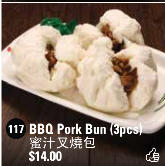
117 BBQ Pork Bun (3pcs) 蜜汁叉燒包 $14.00