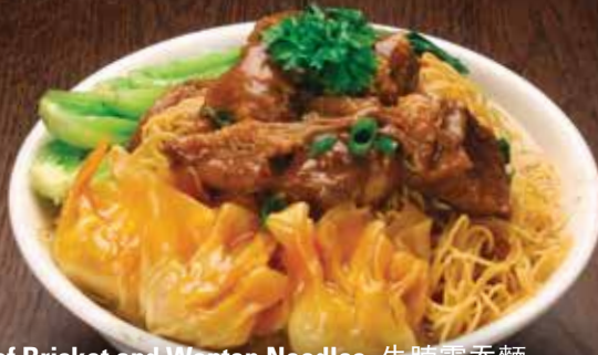
Beef Brisket and Wonton Noodles 牛腩雲吞麵

Please inform our staff on any food allergies. 如有對任何食物過敏，請示意我們的服務員。 | Images are for illustration purposes only. Vegetables are subject to seasonal availability. 圖片只供參考，蔬菜會由季節轉換而定。