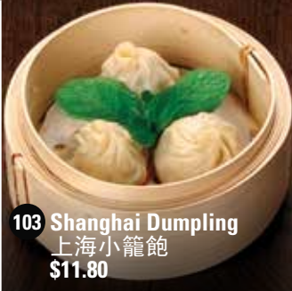
103 Shanghai Dumpling 上海小籠飽 $11.80