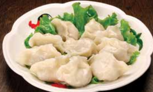
204 Steamed Pork Dumpling (10pcs) 豬肉水餃 $17.90

Please inform our staff on any food allergies. 如有對任何食物過敏，請示意我們的服務員。 | Images are for illustration purposes only. Vegetables are subject to seasonal availability. 圖片只供參考，蔬菜會由季節轉換而定。