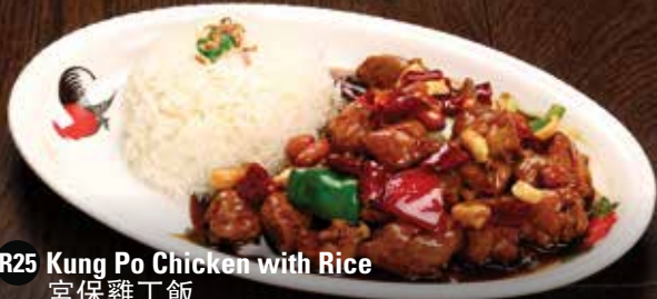
R25 Kung Po Chicken with Rice 宮保雞丁飯