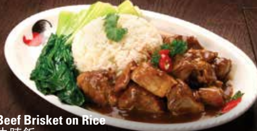
R8 Beef Brisket on Rice 牛腩飯 $21.00