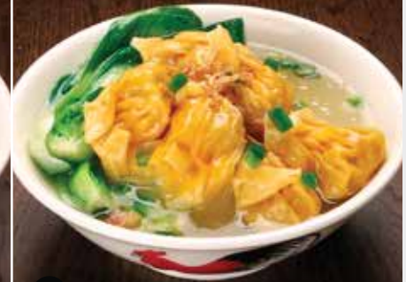
209 Wonton Soup 雲吞湯 $15.50