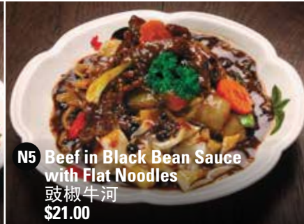
N5 Beef in Black Bean Sauce with Flat Noodles 豉椒牛河 $21.00