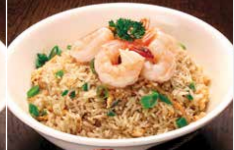
F2 Prawn Fried Rice 蝦仁炒飯 $21.00