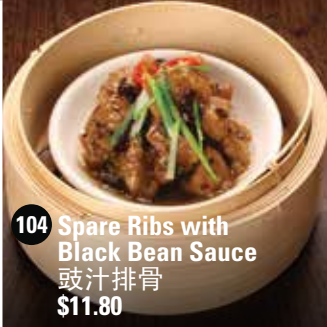
104 Spare Ribs with Black Bean Sauce 豉汁排骨 $11.80