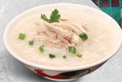
F11 Chicken Congee 雞粥 $19.00