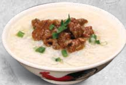
F13 Beef Congee 生滾牛肉粥 $20.50