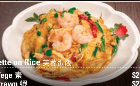
Omelette on Rice 芙蓉蛋飯

R17a Vege 素 R17b Prawn 蝦 R17c BBQ Pork 叉燒