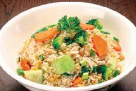
F3 Vegetarian Fried Rice 素菜炒飯 $21.00