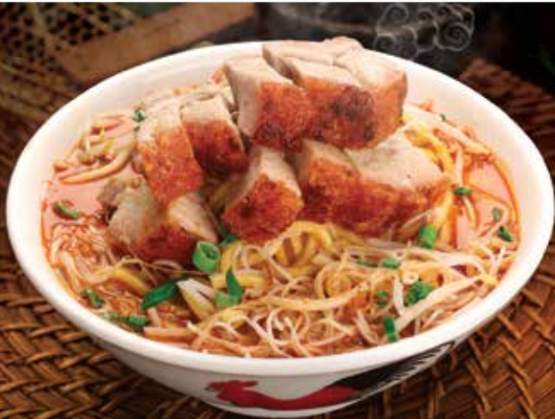
Curry Laksa 喇沙