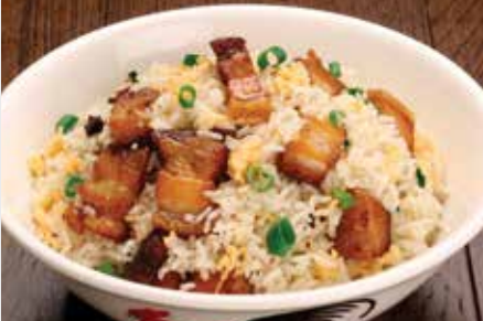
F6 Crispy Pork Fried Rice 燒肉炒飯 $21.00