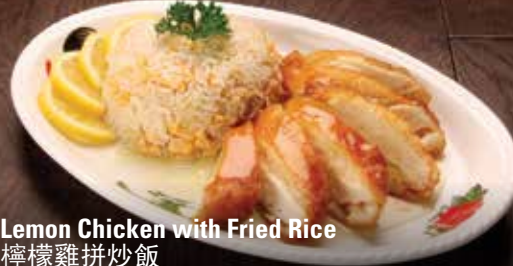
R14 Lemon Chicken with Fried Rice 檸檬雞拼炒飯 $21.00