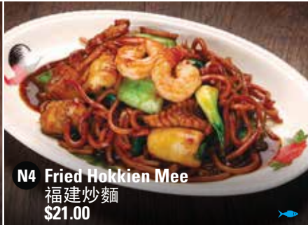
N4 Fried Hokkien Mee 福建炒麵 $21.00