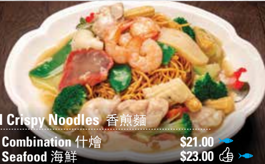
Fried Crispy Noodles 香煎麵