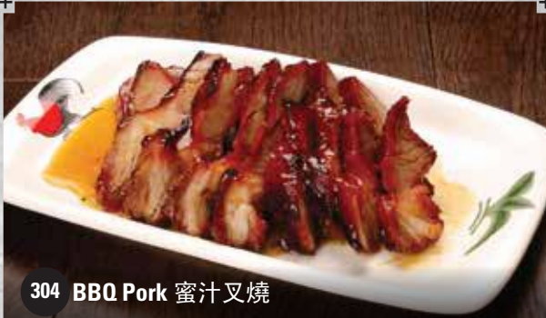
304 BBQ Pork 蜜汁叉燒