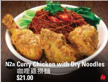
N2a Curry Chicken with Dry Noodles 咖哩雞撈麵 $21.00