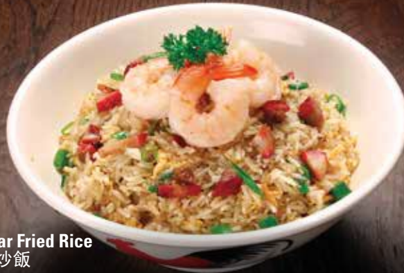
F1 China Bar Fried Rice 不夜天炒飯 $21.00

Please inform our staff on any food allergies. 如有對任何食物過敏，請示意我們的服務員。 | Images are for illustration purposes only. Vegetables are subject to seasonal availability. 圖片只供參考，蔬菜會由季節轉換而定。