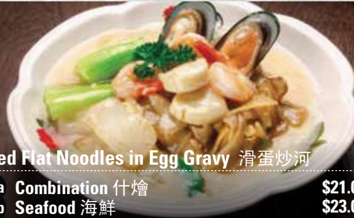
Fried Flat Noodles in Egg Gravy 滑蛋炒河