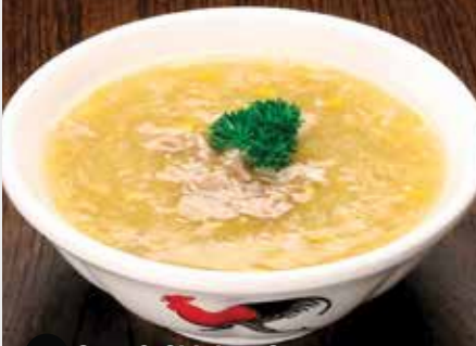
207 Corn & Chicken Soup 粟米雞羹 $12.90