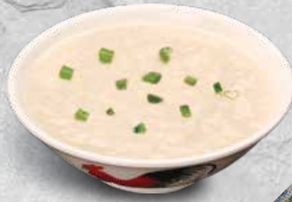
F14 Plain Congee 白粥 $12.00

Please inform our staff on any food allergies. 如有對任何食物過敏，請示意我們的服務員。 | Images are for illustration purposes only. Vegetables are subject to seasonal availability. 圖片只供參考。蔬菜會由季節轉換而定。