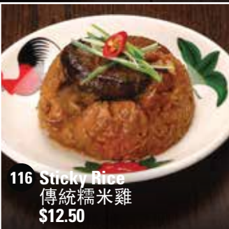
116 Sticky Rice 傳統糯米雞 $12.50