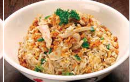
F8 Salted Fish and Chicken Fried Rice 咸魚雞粒炒飯 $21.00