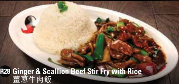
R28 Ginger & Scallion Beef Stir Fry with Rice 薑蔥牛肉飯