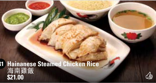
R1 Hainanese Steamed Chicken Rice 海南雞飯 $21.00