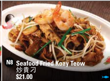
N8 Seafood Fried Koay Teow 炒貴刁 $21.00