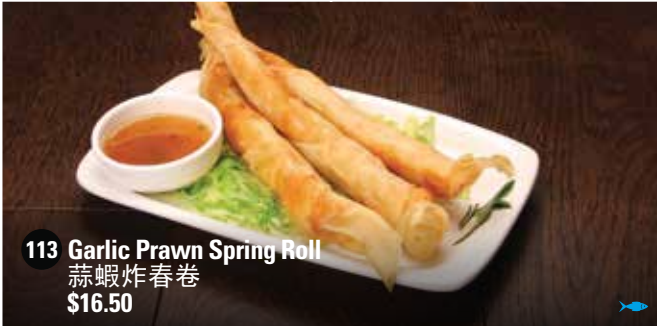
113 Garlic Prawn Spring Roll 蒜蝦炸春卷 $16.50