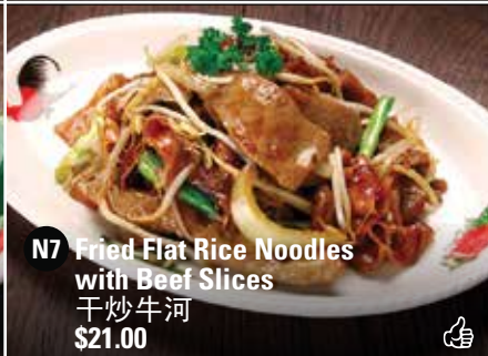
N7 Fried Flat Rice Noodles with Beef Slices 干炒牛河 $21.00