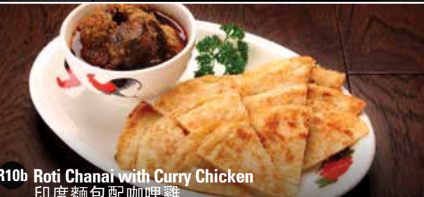
R10b Roti Chanai with Curry Chicken 印度麵包配咖哩雞