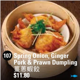
107 Spring Onion, Ginger Pork & Prawn Dumpling 薑蔥蝦餃 $11.80