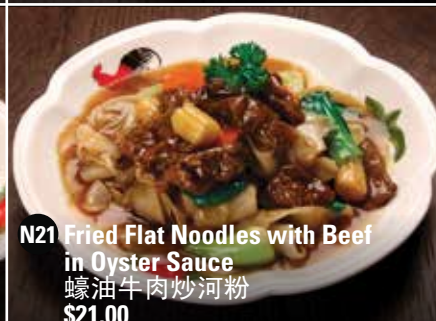
N21 Fried Flat Noodles with Beef in Oyster Sauce 蠔油牛肉炒河粉 $21.00

Please inform our staff on any food allergies. 如有對任何食物過敏，請示意我們的服務員。 | Images are for illustration purposes only. Vegetables are subject to seasonal availability. 圖片只供參考。蔬菜會由季節轉換而定。