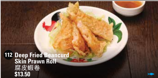
112 Deep Fried Beancurd Skin Prawn Roll 腐皮蝦卷 $13.50