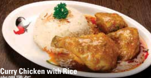
R6b Curry Chicken with Rice 咖哩雞飯 $21.00