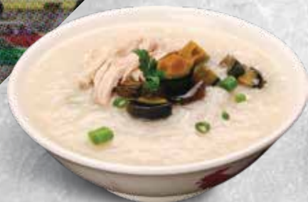
F9 Century Egg & Shredded Chicken Congee 雞絲皮蛋粥 $19.00