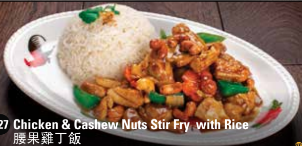
R27 Chicken & Cashew Nuts Stir Fry with Rice 腰果雞丁飯