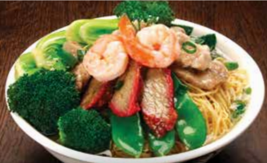
N17 Combination Noodles Soup